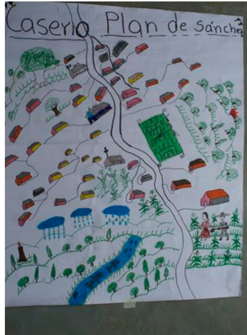
Maps of communities made by survivors.