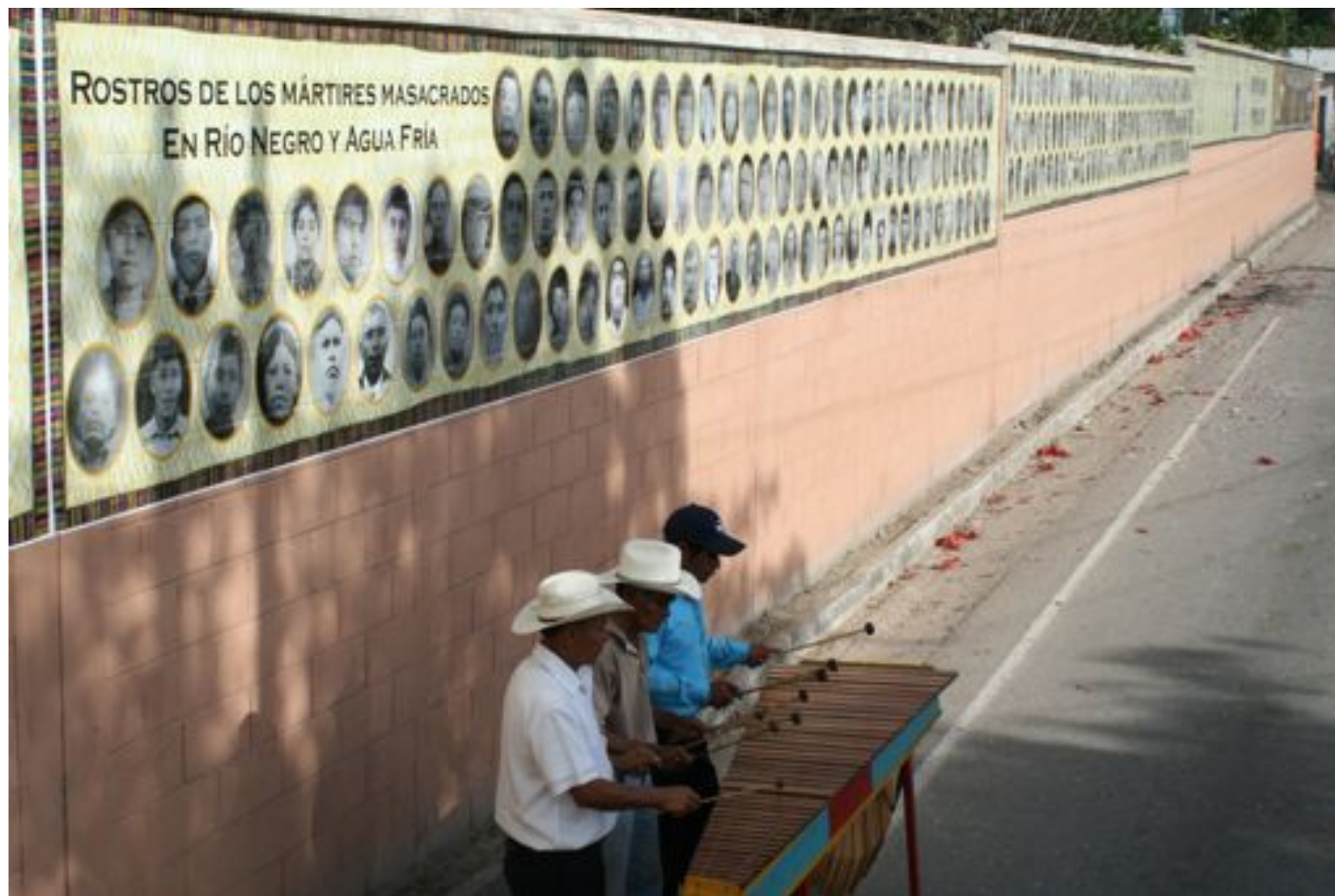
Sounds of marimba in honor of the victims.