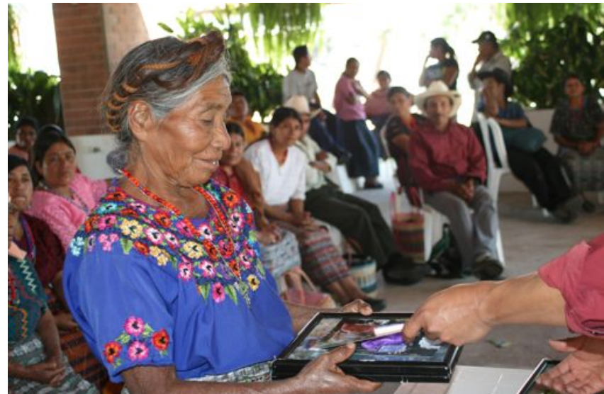
Photographic reunion with family members.