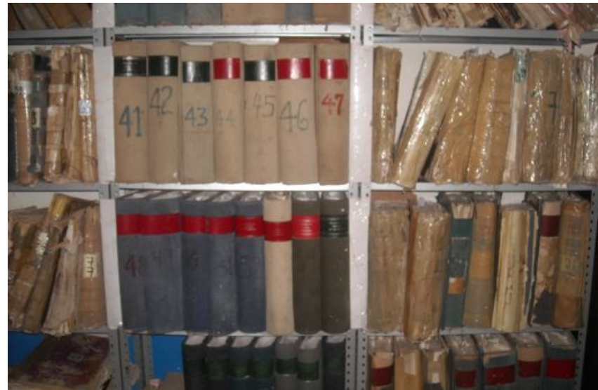
Rescuing photographs that have not been seen in over 28 years.