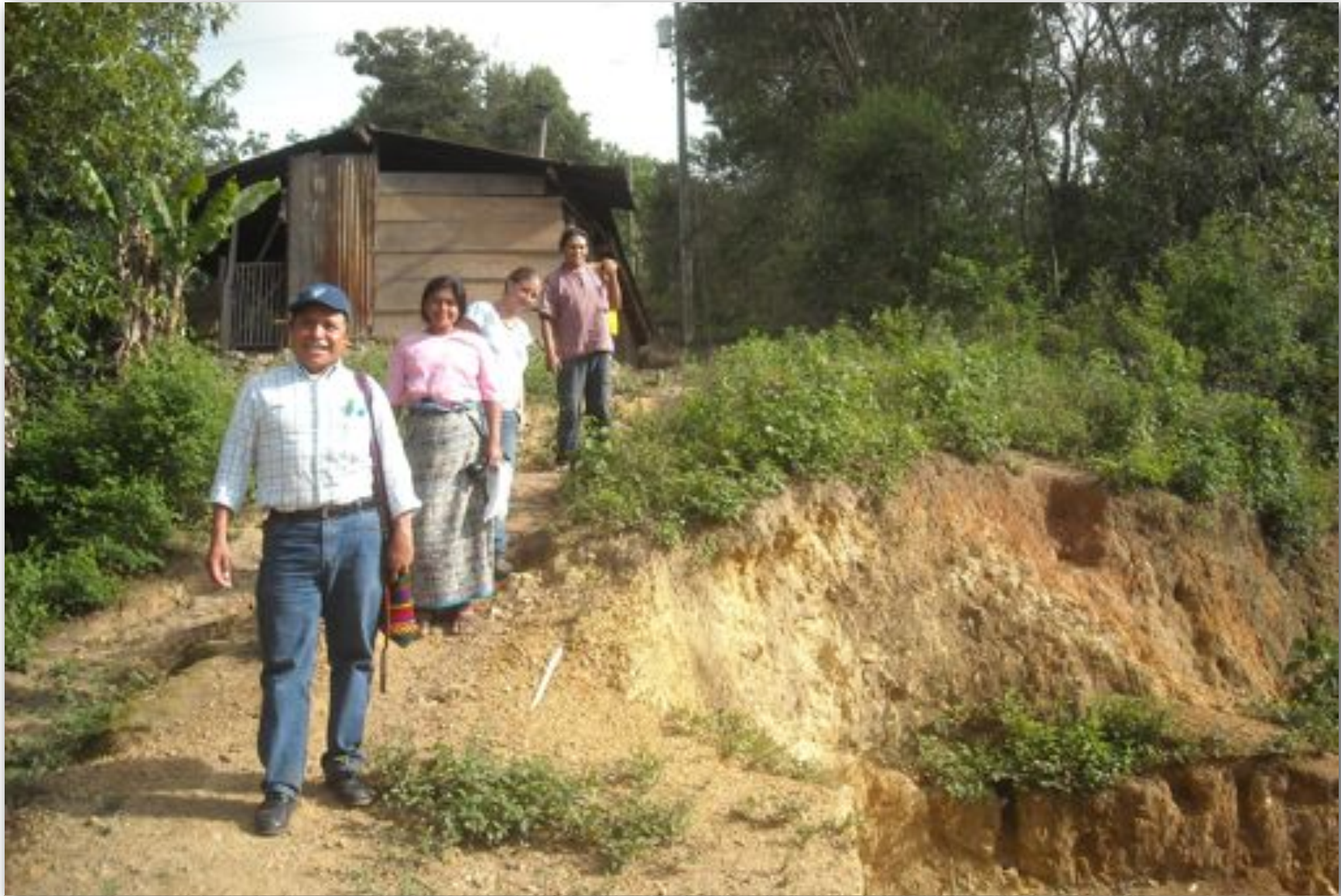
The Documentation Team