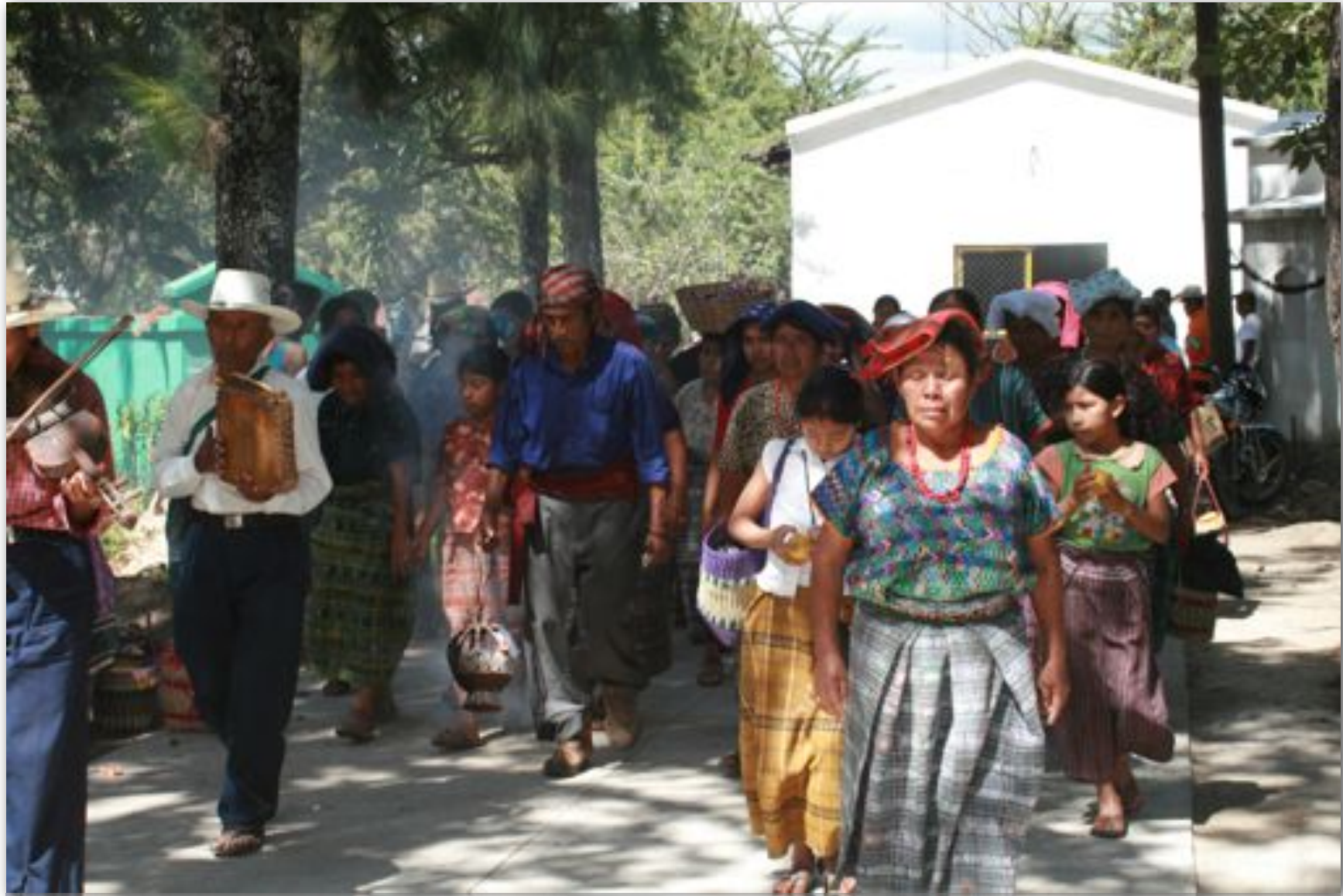
Blessing and procession by spiritual guide and survivors of the victims that were innocently killed.