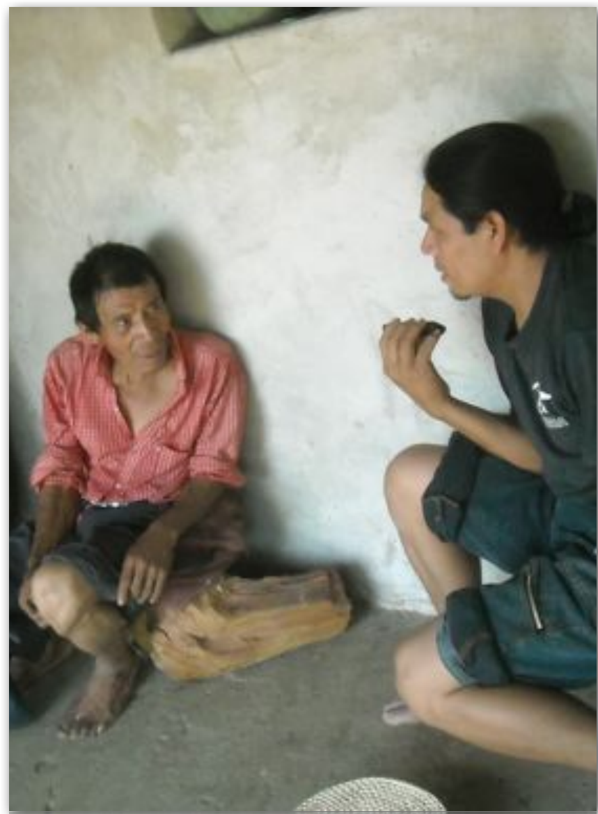
Individual Meetings with survivors.