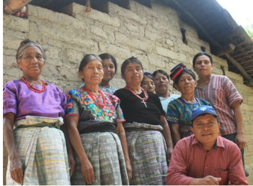
Survivors of the community Panacal and President of AJR.