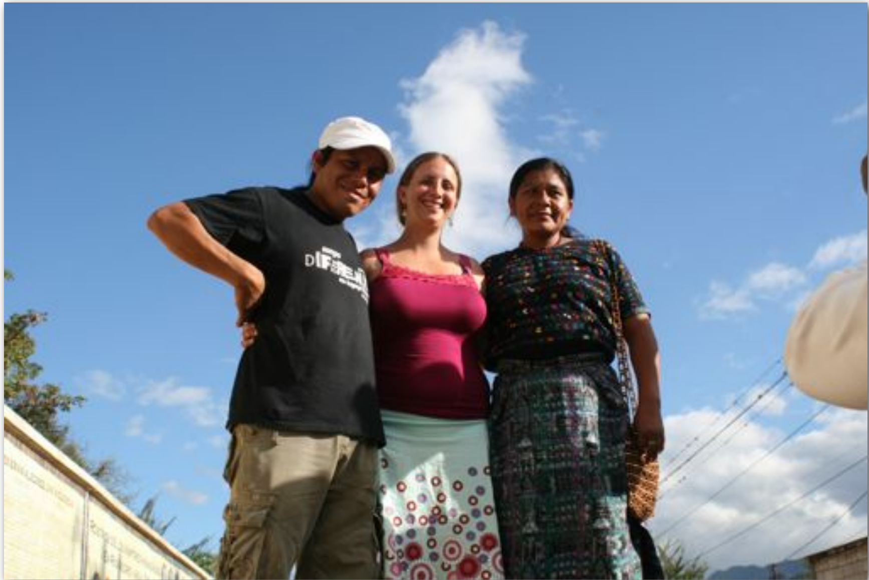
A proud team! (minus one)