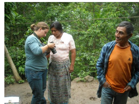
Photographing in the field.